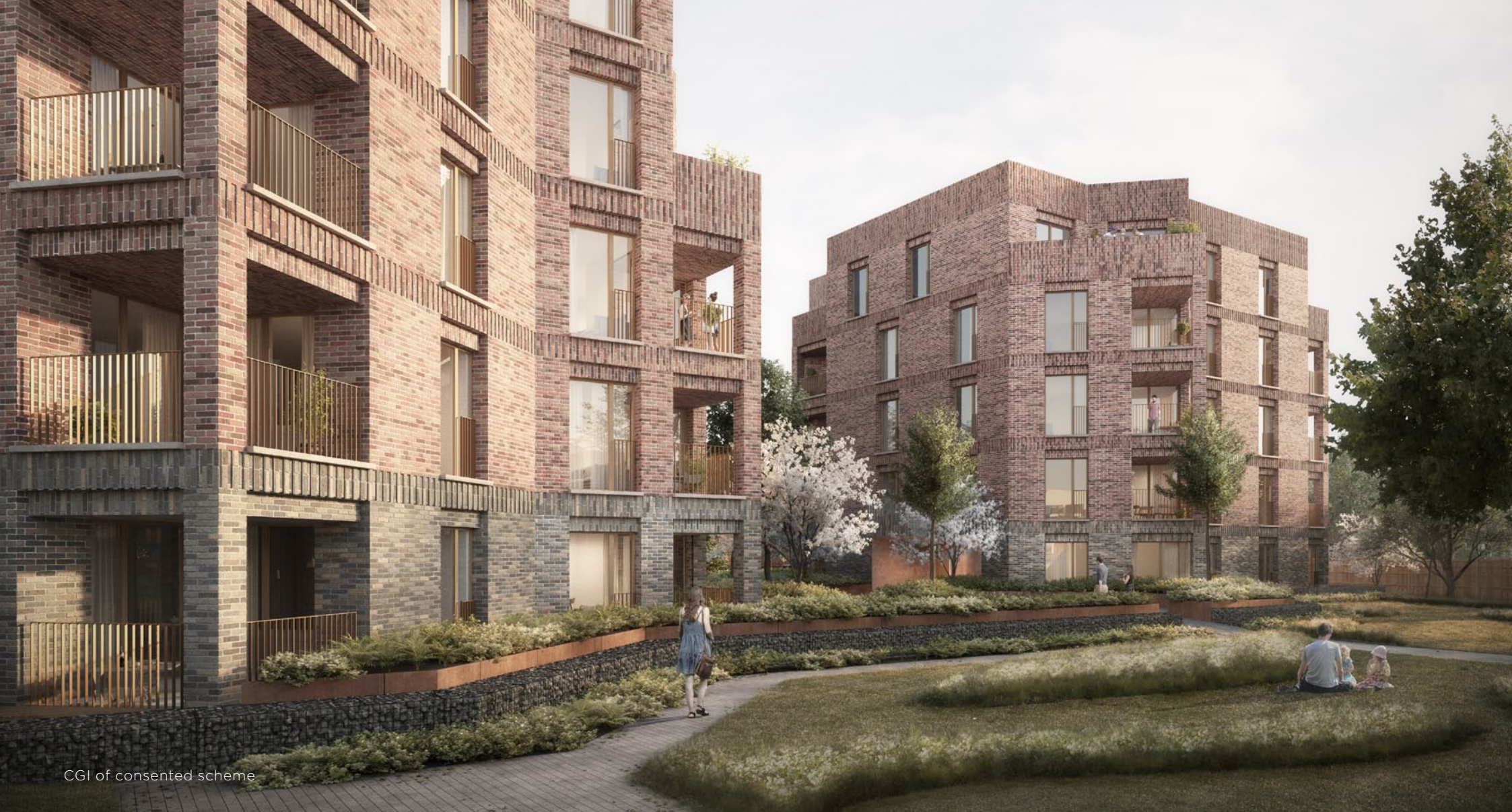
CGI of consented scheme