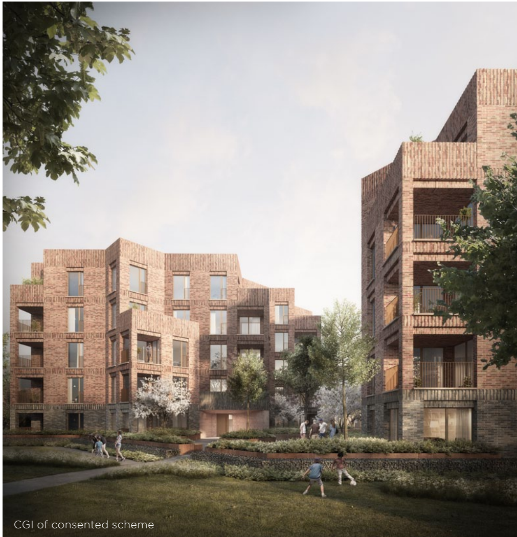
CGI of consented scheme

The site comprises an existing two storey residential property with a large garden surrounding the property. The site extends to approximately 0.34 hectares (0.85 acres) and is located on Rectory Lane. It is bounded to the south by the Fountain Montessori Pre-School, to the north by Herongate, a no-through road, to the east by a service/access road that serves retail and residential units fronting Station Road and to the west by residential properties on Herongate.