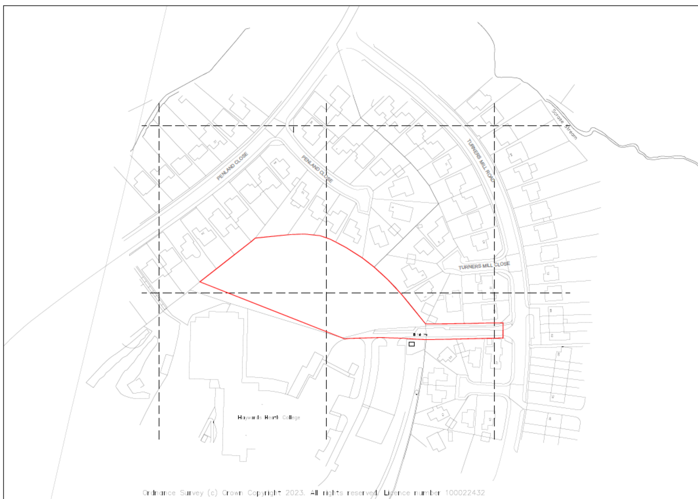
Above: Site Plan

Under application DM/23/3105 consent is now approved for an attractive range of detached and semi-detached residential houses. x12 houses will be available to private buyers with an affordable element of x2 flats and 2 x 2 Bed Terraced Houses built in a separate block.